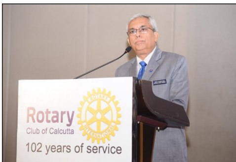
DG addresses the audience