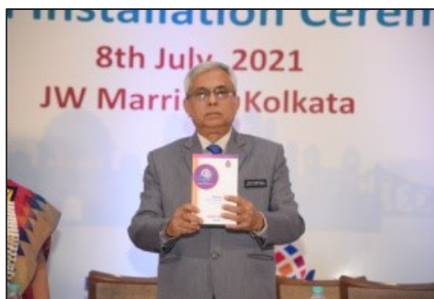
DG releases the Roster