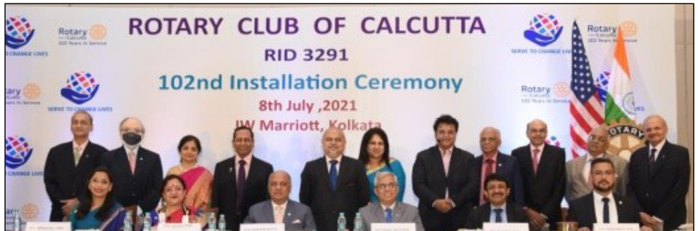
The Board of Directors