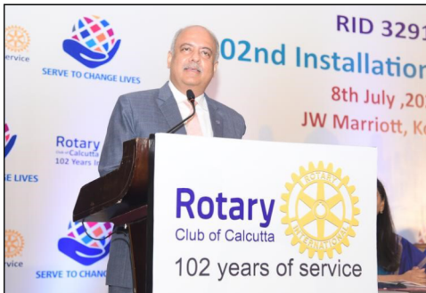
RI President addresses the Audience