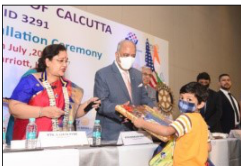
A Little Beneficiary