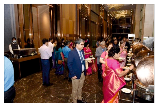
The Buffet Dinner